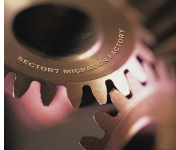
Sector7's Migration Factory helps you retain your software investment.

Software rehosting is a complex process that requires meticulous planning. Replatforming projects are a specific competency, comprising complex engagement managers, powerful rehosting tools, rehosting skills, and hardware and packaged applications. Sector7 has devised a five-step process that efficiently coordinates every aspect of rehosting. Sector7's experience and know-how provide you with a powerful, efficient, and proven rehosting service.